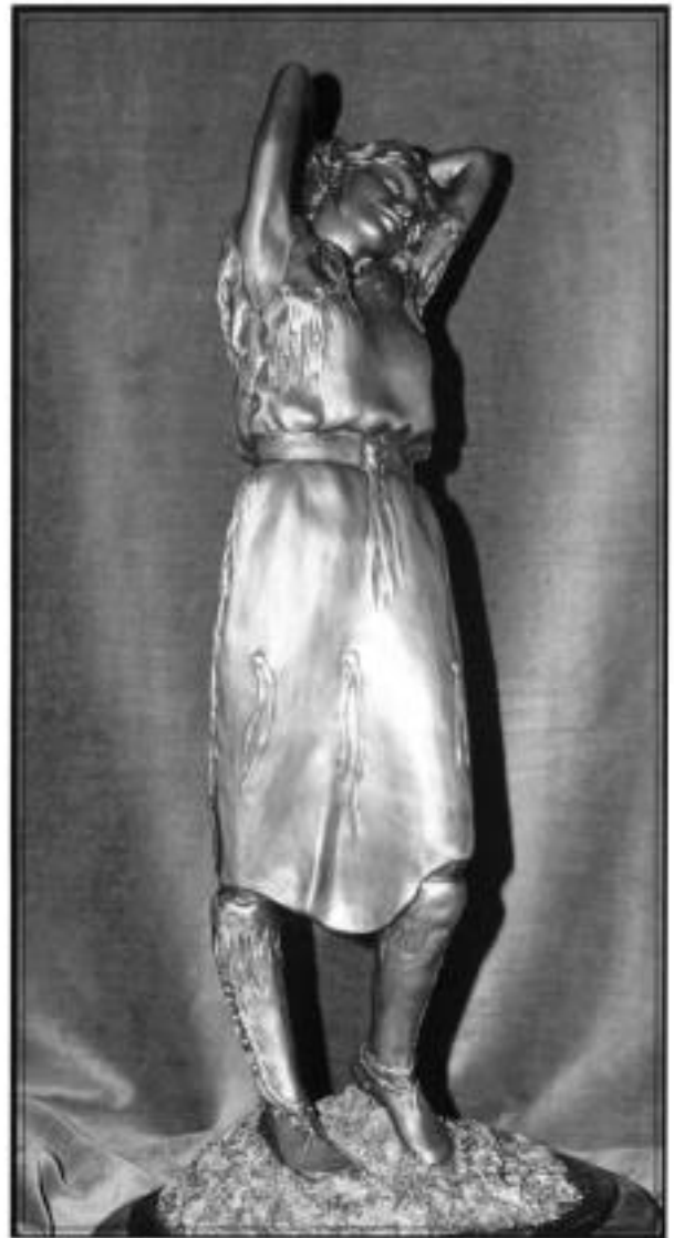
"The Bride," 26 inches tall, bronze