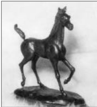
"Arab Dancer," 8 inches tall, bronze